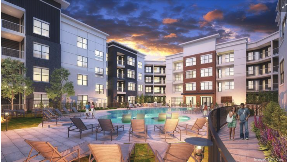
Developer TDK Cos. is newly under construction on this 212-unit apartment complex at Antioch's Century Farms development. The building is set to open in 2021, across from the part of the 310-acre site where Tanger Outlets plans to open a shopping center. TDK COS.